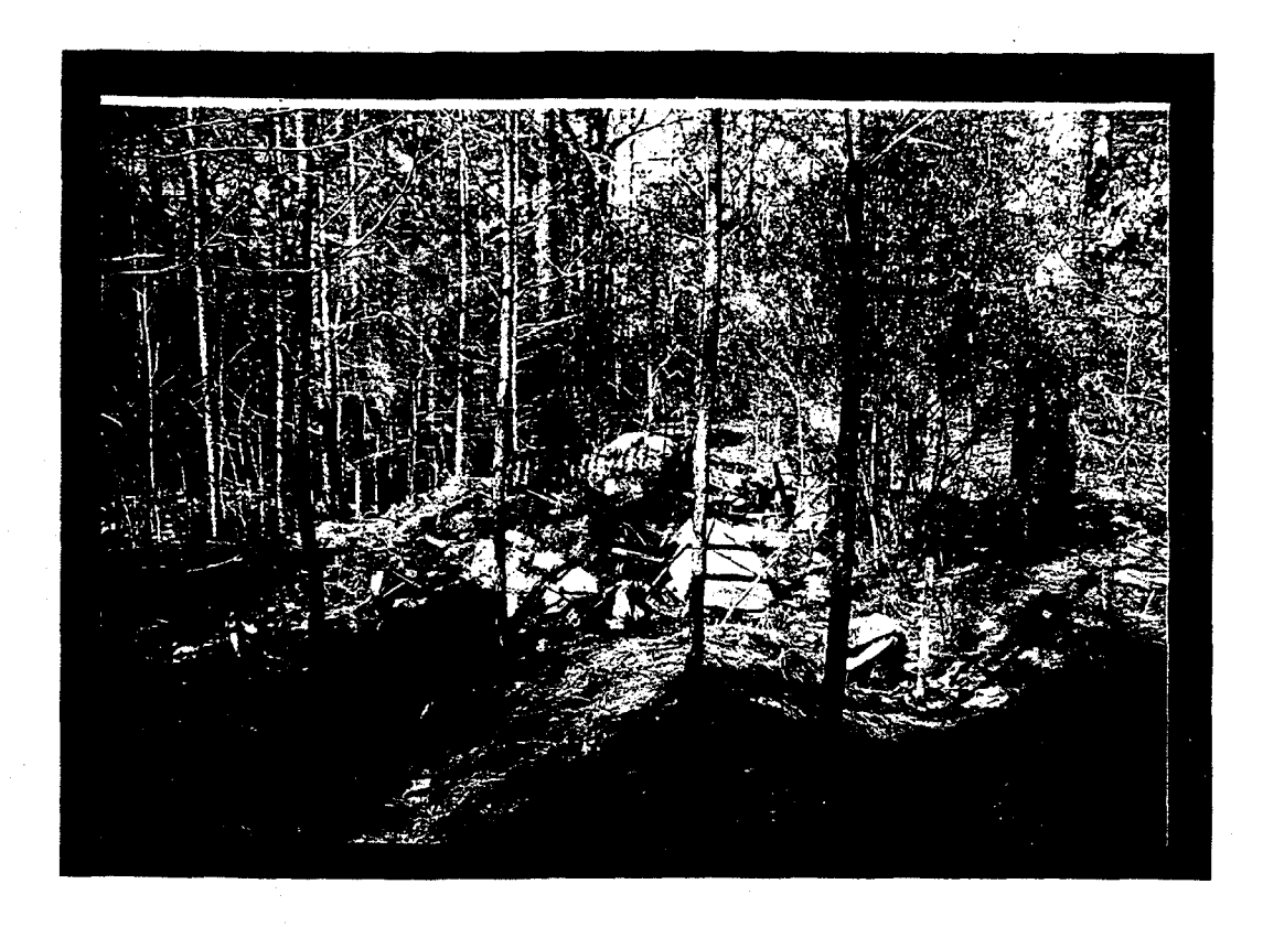
<u>Photograph 2</u>: Reinforced concrete rubble, construction material, and various other inert debris, as pictured, were also identified at Site 63.