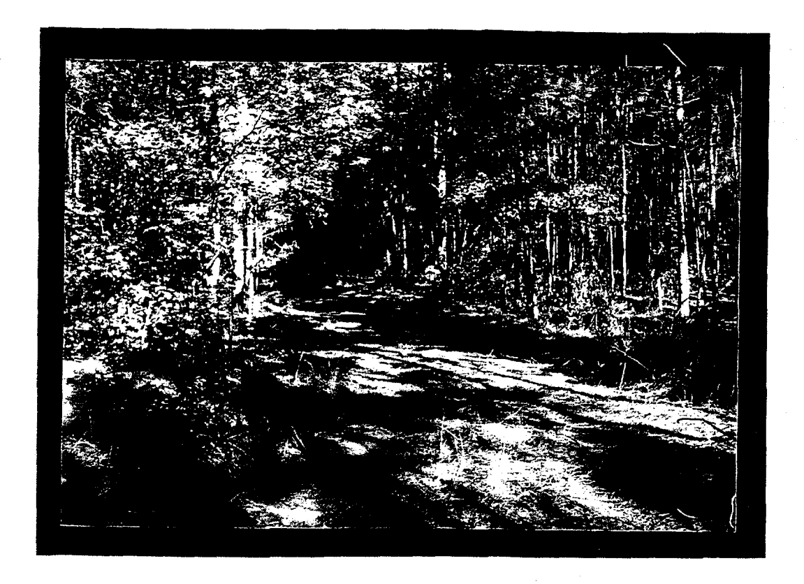
<u>Photograph 1</u>: This photograph was taken facing north from the access road at Site 63. The gravel road pictured here provides access to the central portion of the study area; unimproved paths extend from this road.